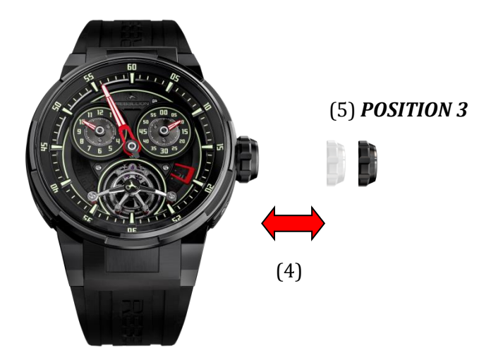
Setting the Time

After pulling the crown (1) to (2), pull one more time the crown out - two clicks (4) to POSITION 3 (5), adjust the hands to the correct time. After having set the time, push the crown back to home position POSITION 1 (1).