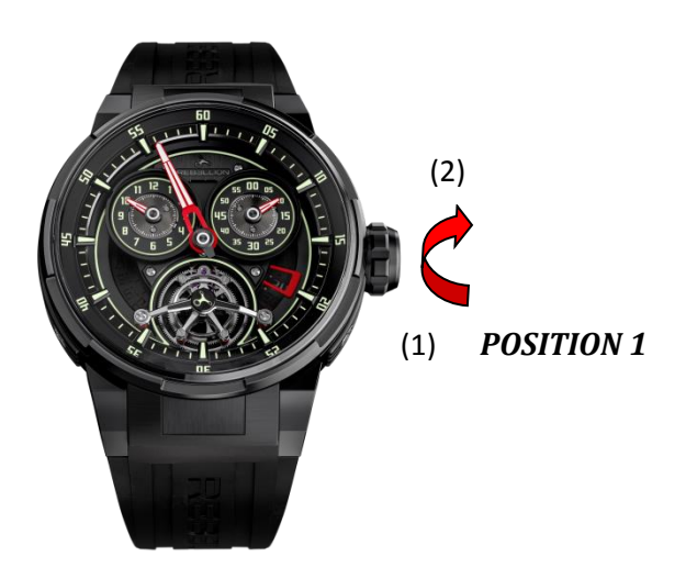
Setting the Date