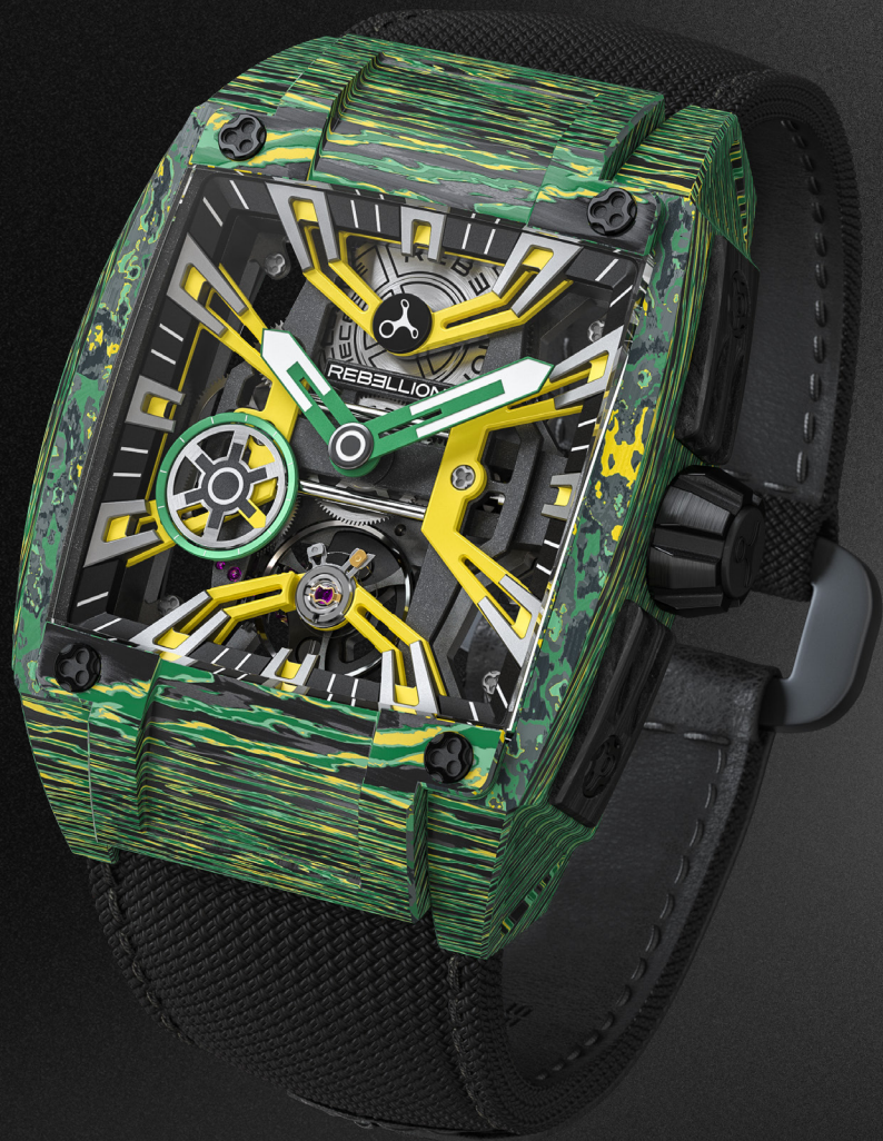
RE-VOLT 3 HANDS TOXIC STORM