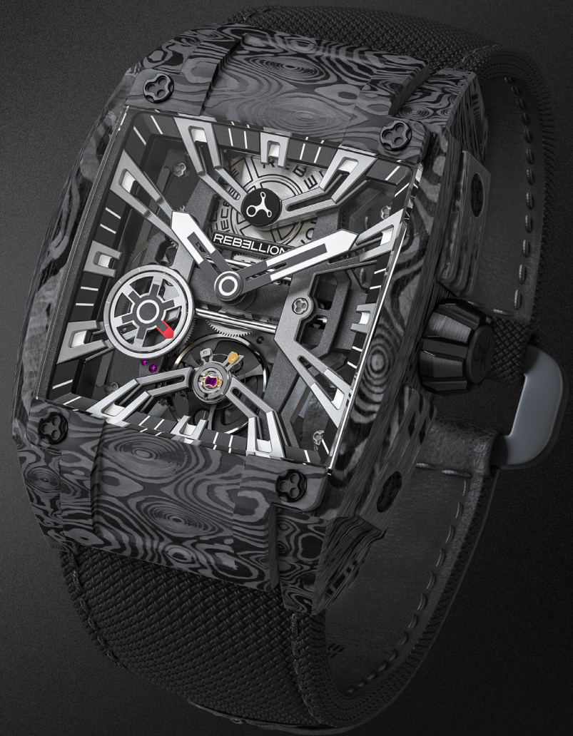
RE-VOLT 3 HANDS BLACK DUNES