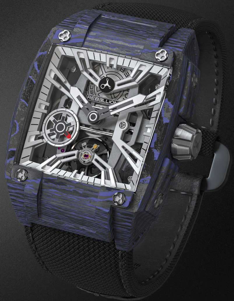
RE-VOLT 3 HANDS PURPLE HAZE