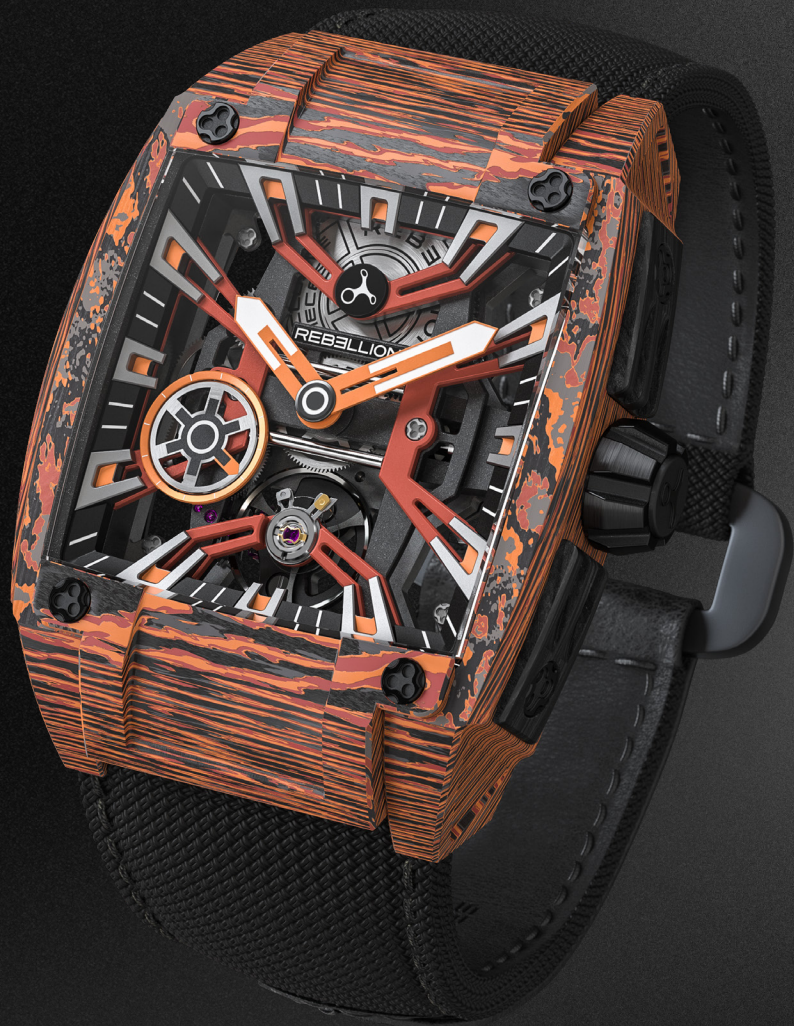
RE-VOLT 3 HANDS MARS VALLEY